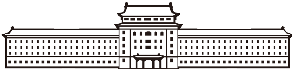
Lighting the Blue Forum